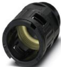
Cable gland, Pg thread, IP68/69k protection, straight

Please be informed that the data shown in this PDF Document is generated from our Online Catalog. Please find the complete data in the user's documentation. Our General Terms of Use for Downloads are valid ( http://phoenixcontact.com/download )