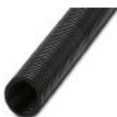
Polyamide protective hose, inflammability class V0, UV resistant

Protective hose - WP-PA HF 28,5 BK - 3240684