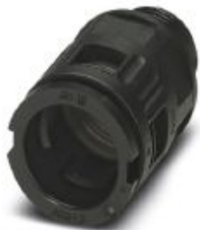
Cable gland, metric thread, IP68/69k protection, straight

Please be informed that the data shown in this PDF Document is generated from our Online Catalog. Please find the complete data in the user's documentation. Our General Terms of Use for Downloads are valid ( http://phoenixcontact.com/download )