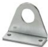
Fixing bracket for protective sleeves, fixed with two screws

Protective hose fixing bracket - WP-BASE A M16 - 3241083