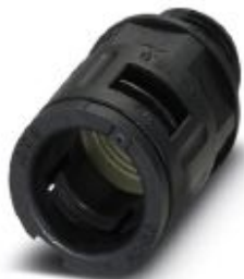
Cable gland, metric thread, IP68/69k protection, straight

Please be informed that the data shown in this PDF Document is generated from our Online Catalog. Please find the complete data in the user's documentation. Our General Terms of Use for Downloads are valid ( http://phoenixcontact.com/download )