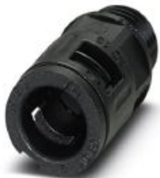
Cable gland, Pg thread, IP66 protection, straight

Please be informed that the data shown in this PDF Document is generated from our Online Catalog. Please find the complete data in the user's documentation. Our General Terms of Use for Downloads are valid ( http://phoenixcontact.com/download )