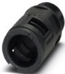
Cable gland, Pg thread, IP66 protection, straight

Please be informed that the data shown in this PDF Document is generated from our Online Catalog. Please find the complete data in the user's documentation. Our General Terms of Use for Downloads are valid ( http://phoenixcontact.com/download )