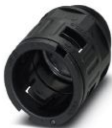
Cable gland, Pg thread, IP66 protection, straight

Please be informed that the data shown in this PDF Document is generated from our Online Catalog. Please find the complete data in the user's documentation. Our General Terms of Use for Downloads are valid ( http://phoenixcontact.com/download )