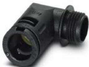
Cable gland, Pg thread, IP68/69k protection, angled

Please be informed that the data shown in this PDF Document is generated from our Online Catalog. Please find the complete data in the user's documentation. Our General Terms of Use for Downloads are valid ( http://phoenixcontact.com/download )