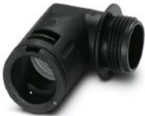
Cable gland, Pg thread, IP68/69k protection, angled

Please be informed that the data shown in this PDF Document is generated from our Online Catalog. Please find the complete data in the user's documentation. Our General Terms of Use for Downloads are valid ( http://phoenixcontact.com/download )