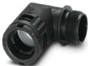
Cable gland, Pg thread, IP68/69k protection, angled

Please be informed that the data shown in this PDF Document is generated from our Online Catalog. Please find the complete data in the user's documentation. Our General Terms of Use for Downloads are valid ( http://phoenixcontact.com/download )