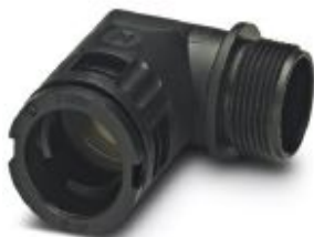
Cable gland, metric thread, IP68/69k protection, angled

Please be informed that the data shown in this PDF Document is generated from our Online Catalog. Please find the complete data in the user's documentation. Our General Terms of Use for Downloads are valid ( http://phoenixcontact.com/download )