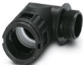
Cable gland, metric thread, IP68/69k protection, angled

Please be informed that the data shown in this PDF Document is generated from our Online Catalog. Please find the complete data in the user's documentation. Our General Terms of Use for Downloads are valid ( http://phoenixcontact.com/download )