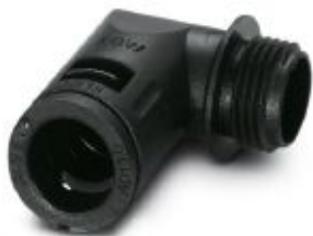
Cable gland, Pg thread, IP66 protection, angled

Please be informed that the data shown in this PDF Document is generated from our Online Catalog. Please find the complete data in the user's documentation. Our General Terms of Use for Downloads are valid ( http://phoenixcontact.com/download )