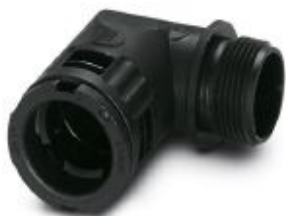
Cable gland, Pg thread, IP66 protection, angled

Please be informed that the data shown in this PDF Document is generated from our Online Catalog. Please find the complete data in the user's documentation. Our General Terms of Use for Downloads are valid ( http://phoenixcontact.com/download )