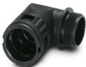
Cable gland, Pg thread, IP66 protection, angled

Please be informed that the data shown in this PDF Document is generated from our Online Catalog. Please find the complete data in the user's documentation. Our General Terms of Use for Downloads are valid ( http://phoenixcontact.com/download )