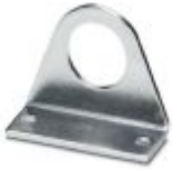
Fixing bracket for protective sleeves, fixed with two screws

Protective hose fixing bracket - WP-BASE A PG21 - 3241080