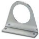
Fixing bracket for protective sleeves, fixed with two screws

Protective hose fixing bracket - WP-BASE A PG29 - 3241081