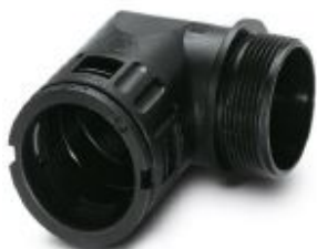
Cable gland, Pg thread, IP66 protection, angled

Please be informed that the data shown in this PDF Document is generated from our Online Catalog. Please find the complete data in the user's documentation. Our General Terms of Use for Downloads are valid ( http://phoenixcontact.com/download )