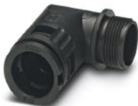
Cable gland, metric thread, IP66 protection, angled

Please be informed that the data shown in this PDF Document is generated from our Online Catalog. Please find the complete data in the user's documentation. Our General Terms of Use for Downloads are valid ( http://phoenixcontact.com/download )