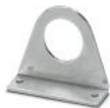
Fixing bracket for protective sleeves, fixed with two screws

Protective hose fixing bracket - WP-BASE A M25 - 3241085