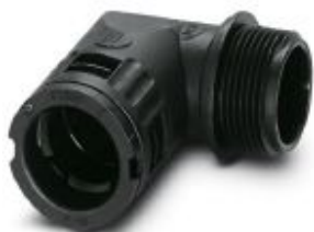
Cable gland, metric thread, IP66 protection, angled

Please be informed that the data shown in this PDF Document is generated from our Online Catalog. Please find the complete data in the user's documentation. Our General Terms of Use for Downloads are valid ( http://phoenixcontact.com/download )