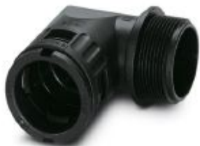
Cable gland, metric thread, IP66 protection, angled

Please be informed that the data shown in this PDF Document is generated from our Online Catalog. Please find the complete data in the user's documentation. Our General Terms of Use for Downloads are valid ( http://phoenixcontact.com/download )