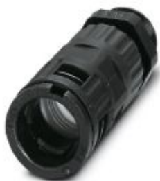
Cable gland, Pg thread, IP68/69k protection, with strain relief

Please be informed that the data shown in this PDF Document is generated from our Online Catalog. Please find the complete data in the user's documentation. Our General Terms of Use for Downloads are valid ( http://phoenixcontact.com/download )