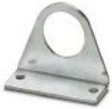
Fixing bracket for protective sleeves, fixed with two screws

Protective hose fixing bracket - WP-BASE A PG16 - 3241079