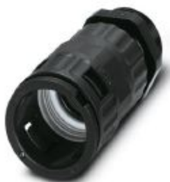
Cable gland, Pg thread, IP68/69k protection, with strain relief

Please be informed that the data shown in this PDF Document is generated from our Online Catalog. Please find the complete data in the user's documentation. Our General Terms of Use for Downloads are valid ( http://phoenixcontact.com/download )