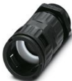
Cable gland, Pg thread, IP68/69k protection, with strain relief

Please be informed that the data shown in this PDF Document is generated from our Online Catalog. Please find the complete data in the user's documentation. Our General Terms of Use for Downloads are valid ( http://phoenixcontact.com/download )