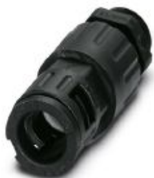
Cable gland, metric thread, IP68/69k protection, with strain relief

Please be informed that the data shown in this PDF Document is generated from our Online Catalog. Please find the complete data in the user's documentation. Our General Terms of Use for Downloads are valid ( http://phoenixcontact.com/download )