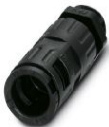
Cable gland, Pg thread, IP66 protection, with strain relief

Please be informed that the data shown in this PDF Document is generated from our Online Catalog. Please find the complete data in the user's documentation. Our General Terms of Use for Downloads are valid ( http://phoenixcontact.com/download )