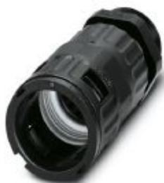
Cable gland, Pg thread, IP66 protection, with strain relief

Please be informed that the data shown in this PDF Document is generated from our Online Catalog. Please find the complete data in the user's documentation. Our General Terms of Use for Downloads are valid ( http://phoenixcontact.com/download )