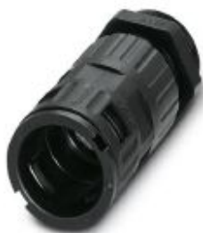
Cable gland, metric thread, IP66 protection, with strain relief

Please be informed that the data shown in this PDF Document is generated from our Online Catalog. Please find the complete data in the user's documentation. Our General Terms of Use for Downloads are valid ( http://phoenixcontact.com/download )