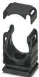
Hose holder with cover

Please be informed that the data shown in this PDF Document is generated from our Online Catalog. Please find the complete data in the user's documentation. Our General Terms of Use for Downloads are valid ( http://phoenixcontact.com/download )