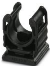
Hose holder with cover

Please be informed that the data shown in this PDF Document is generated from our Online Catalog. Please find the complete data in the user's documentation. Our General Terms of Use for Downloads are valid ( http://phoenixcontact.com/download )