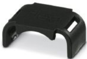
Hose holder with cover

Please be informed that the data shown in this PDF Document is generated from our Online Catalog. Please find the complete data in the user's documentation. Our General Terms of Use for Downloads are valid ( http://phoenixcontact.com/download )