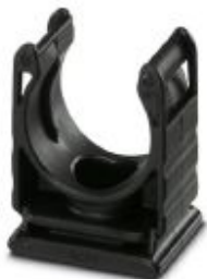
Hose holder with cover

Please be informed that the data shown in this PDF Document is generated from our Online Catalog. Please find the complete data in the user's documentation. Our General Terms of Use for Downloads are valid ( http://phoenixcontact.com/download )