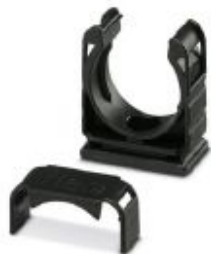
Hose holder with cover

Please be informed that the data shown in this PDF Document is generated from our Online Catalog. Please find the complete data in the user's documentation. Our General Terms of Use for Downloads are valid ( http://phoenixcontact.com/download )