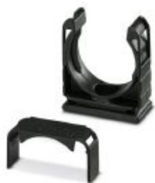
Hose holder with cover

Please be informed that the data shown in this PDF Document is generated from our Online Catalog. Please find the complete data in the user's documentation. Our General Terms of Use for Downloads are valid ( http://phoenixcontact.com/download )