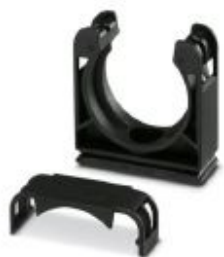
Hose holder with cover

Please be informed that the data shown in this PDF Document is generated from our Online Catalog. Please find the complete data in the user's documentation. Our General Terms of Use for Downloads are valid ( http://phoenixcontact.com/download )