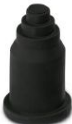
End sleeves, transition sleeves, from hose to cable

Please be informed that the data shown in this PDF Document is generated from our Online Catalog. Please find the complete data in the user's documentation. Our General Terms of Use for Downloads are valid ( http://phoenixcontact.com/download )