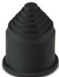
End sleeves, transition sleeves, from hose to cable

Please be informed that the data shown in this PDF Document is generated from our Online Catalog. Please find the complete data in the user's documentation. Our General Terms of Use for Downloads are valid ( http://phoenixcontact.com/download )