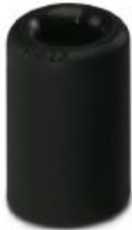
End sleeves as cable protection

Please be informed that the data shown in this PDF Document is generated from our Online Catalog. Please find the complete data in the user's documentation. Our General Terms of Use for Downloads are valid ( http://phoenixcontact.com/download )