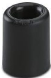
End sleeves as cable protection

Please be informed that the data shown in this PDF Document is generated from our Online Catalog. Please find the complete data in the user's documentation. Our General Terms of Use for Downloads are valid ( http://phoenixcontact.com/download )