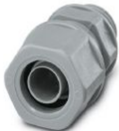
Cable gland made from PP with Pg thread, IP65 protection

Please be informed that the data shown in this PDF Document is generated from our Online Catalog. Please find the complete data in the user's documentation. Our General Terms of Use for Downloads are valid ( http://phoenixcontact.com/download )