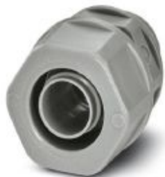
Cable gland made from PP with Pg thread, IP65 protection

Please be informed that the data shown in this PDF Document is generated from our Online Catalog. Please find the complete data in the user's documentation. Our General Terms of Use for Downloads are valid ( http://phoenixcontact.com/download )