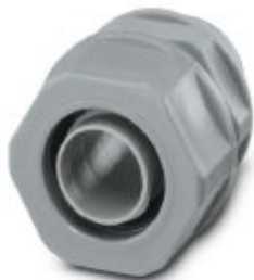
Cable gland made from PP with Pg thread, IP65 protection

Please be informed that the data shown in this PDF Document is generated from our Online Catalog. Please find the complete data in the user's documentation. Our General Terms of Use for Downloads are valid ( http://phoenixcontact.com/download )