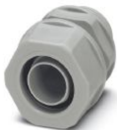
Cable gland made from PP with metric thread, IP65 protection

Please be informed that the data shown in this PDF Document is generated from our Online Catalog. Please find the complete data in the user's documentation. Our General Terms of Use for Downloads are valid ( http://phoenixcontact.com/download )