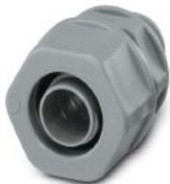
Cable gland made from PP with metric thread, IP65 protection

Please be informed that the data shown in this PDF Document is generated from our Online Catalog. Please find the complete data in the user's documentation. Our General Terms of Use for Downloads are valid ( http://phoenixcontact.com/download )