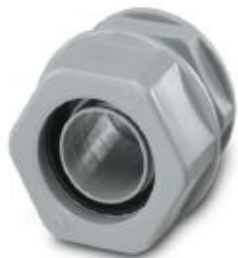
Cable gland made from PP with metric thread, IP65 protection

Please be informed that the data shown in this PDF Document is generated from our Online Catalog. Please find the complete data in the user's documentation. Our General Terms of Use for Downloads are valid ( http://phoenixcontact.com/download )