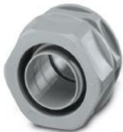
Cable gland made from PP with metric thread, IP65 protection

Please be informed that the data shown in this PDF Document is generated from our Online Catalog. Please find the complete data in the user's documentation. Our General Terms of Use for Downloads are valid ( http://phoenixcontact.com/download )