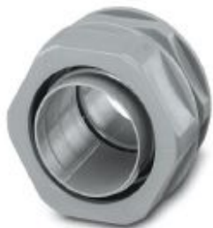
Cable gland made from PP with metric thread, IP65 protection

Please be informed that the data shown in this PDF Document is generated from our Online Catalog. Please find the complete data in the user's documentation. Our General Terms of Use for Downloads are valid ( http://phoenixcontact.com/download )