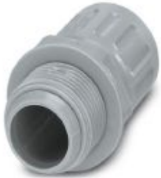
Cable gland made from PP with Pg thread, rotatable, IP54 protection

Please be informed that the data shown in this PDF Document is generated from our Online Catalog. Please find the complete data in the user's documentation. Our General Terms of Use for Downloads are valid ( http://phoenixcontact.com/download )