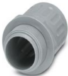
Cable gland made from PP with Pg thread, rotatable, IP54 protection

Please be informed that the data shown in this PDF Document is generated from our Online Catalog. Please find the complete data in the user's documentation. Our General Terms of Use for Downloads are valid ( http://phoenixcontact.com/download )