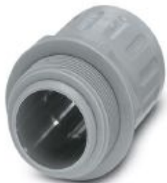
Cable gland made from PP with metric thread, rotatable, IP54 protection

Please be informed that the data shown in this PDF Document is generated from our Online Catalog. Please find the complete data in the user's documentation. Our General Terms of Use for Downloads are valid ( http://phoenixcontact.com/download )