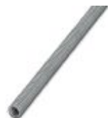
Protective hose, spring steel wire with PVC coating, highly stranded

Protective hose - WP-SPIRAL PVC C 14 - 3240850