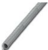
Protective hose, spring steel wire with PVC coating, highly stranded

Protective hose - WP-SPIRAL PVC C 17 - 3240851