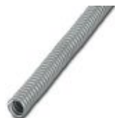
Protective hose, spring steel wire with PVC coating, highly stranded

Protective hose - WP-SPIRAL PVC C 21 - 3240852